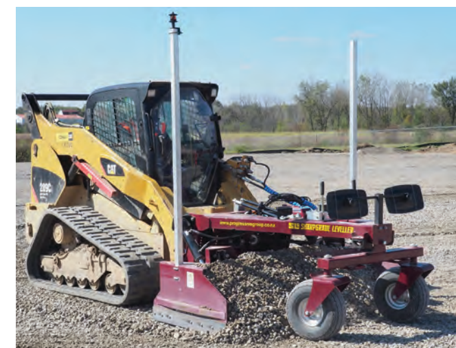
HEAVY DUTY 2.2 (7') SERIES