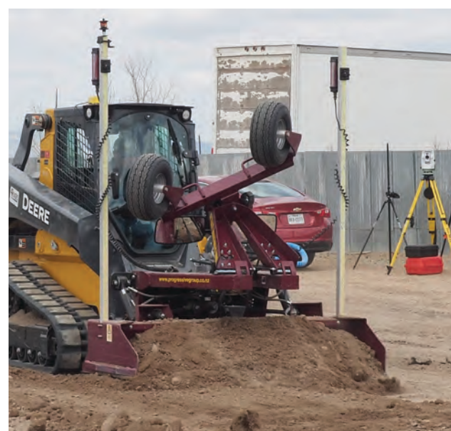
3D TPS CONTROL SYSTEM