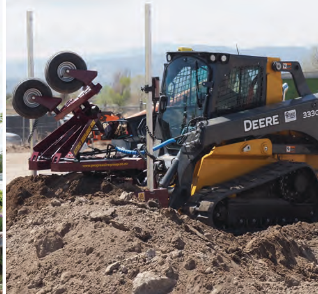
RETRACTING FRONT WHEELS