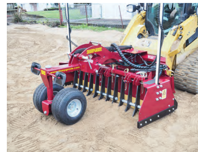
STANDARD 2.0 / 2.2 (6'6" / 7') SERIES