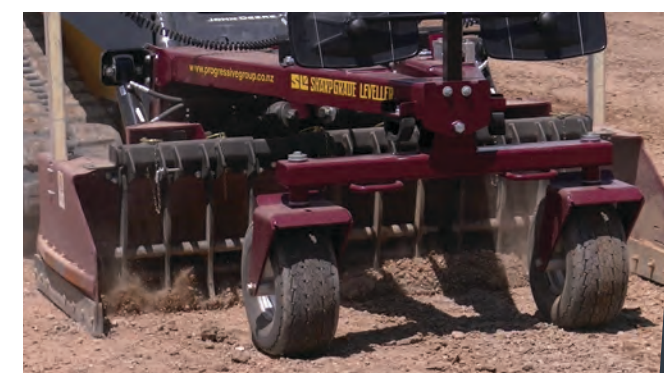
CLIP ON SCARIFIERS