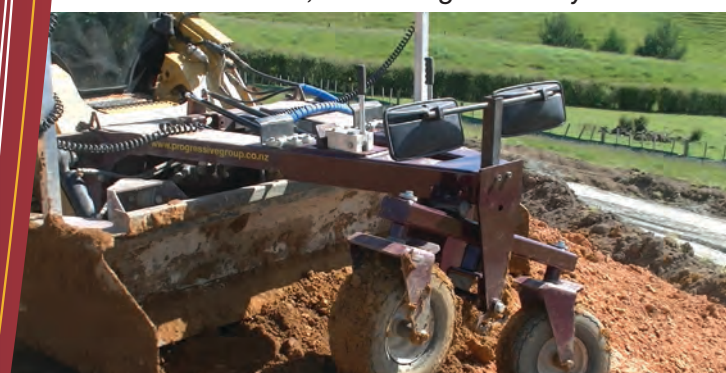
UNDERSLUNG WALKING BEAM