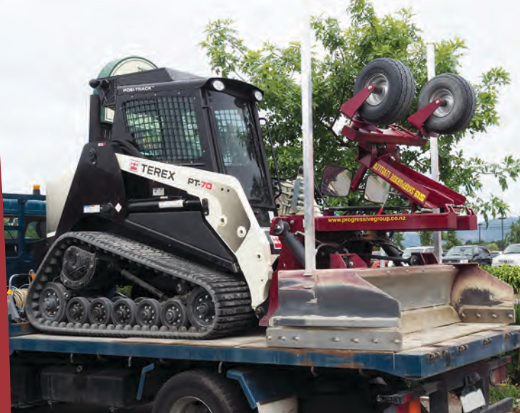
SHORT TRANSPORT LENGTH