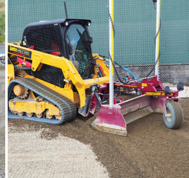
COMPACT 1.8 (6') SERIES