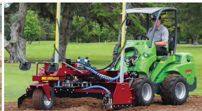
FRONT MOUNTED POWER RAKE OPTION