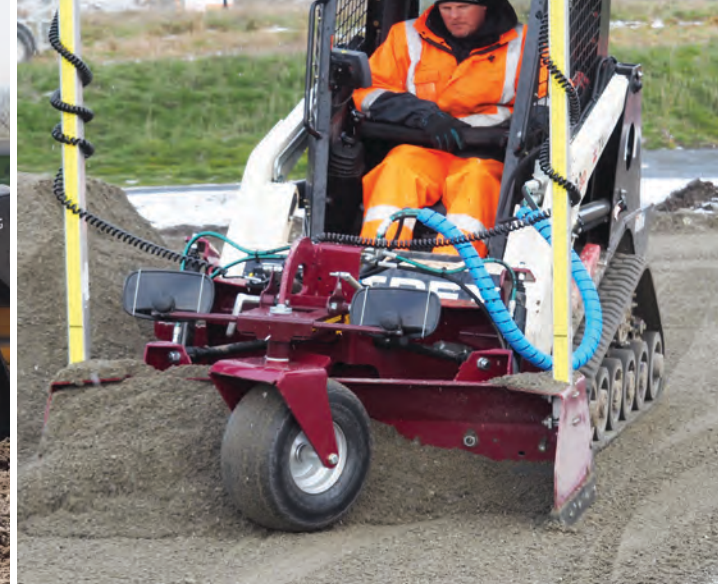
JUNIOR 1.5 (5') SERIES