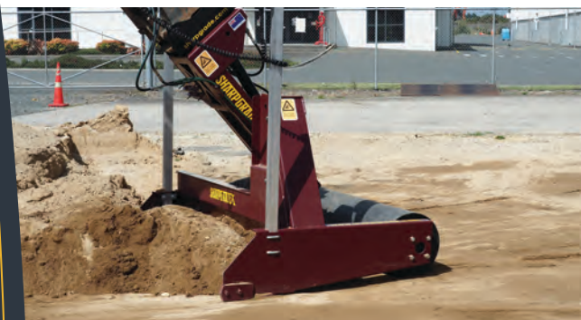
SHARPGRADEX FOR EXCAVATORS