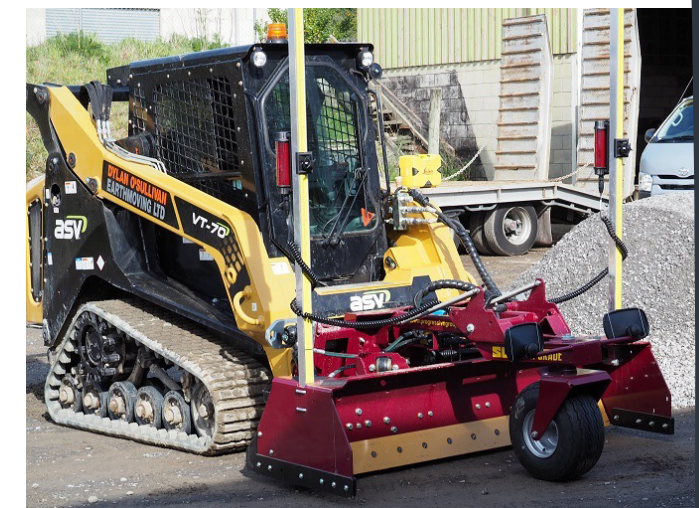
MEDIUM 2.0 (6' 6") SERIES