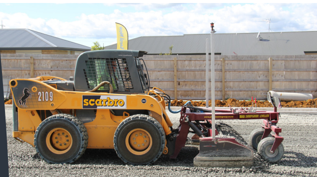
HEAVY DUTY TPS CONTROL