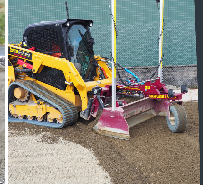
COMPACT 1.8 (6') SERIES