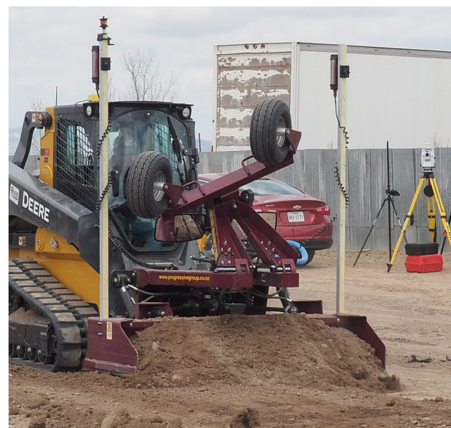
3D TPS CONTROL SYSTEM