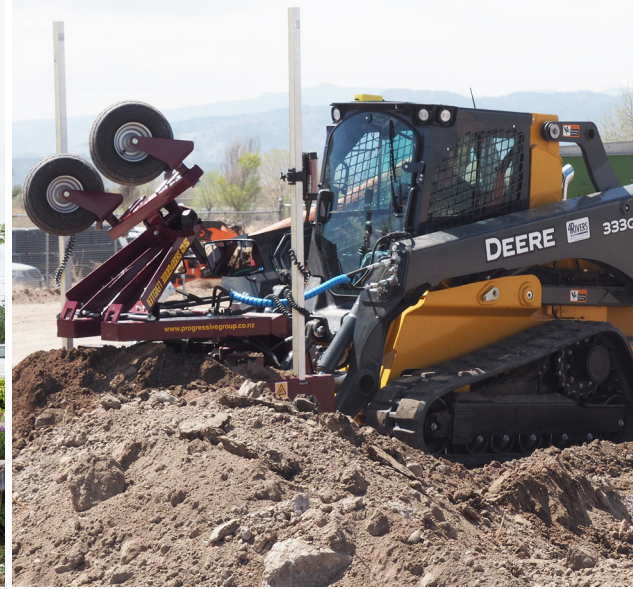
RETRACTING FRONT WHEELS