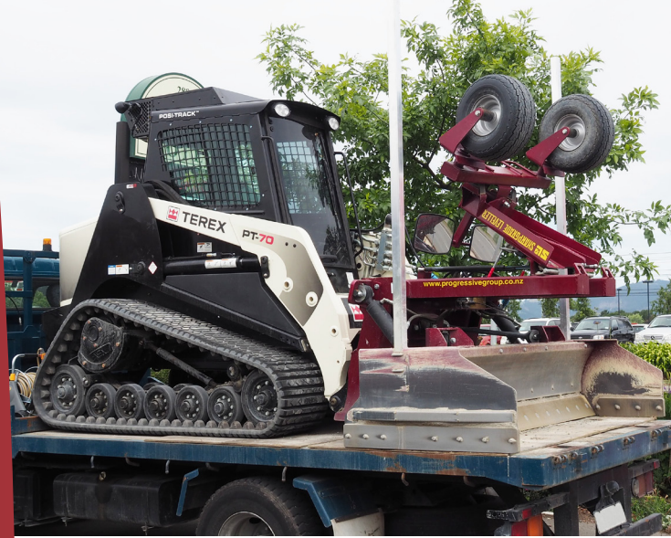
SHORT TRANSPORT LENGTH