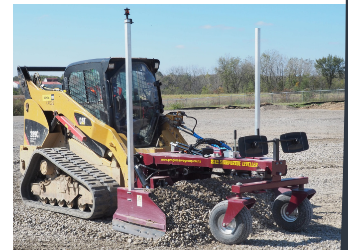
HEAVY DUTY 2.2 (7') SERIES