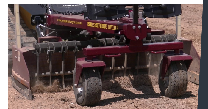
CLIP ON SCARIFIERS