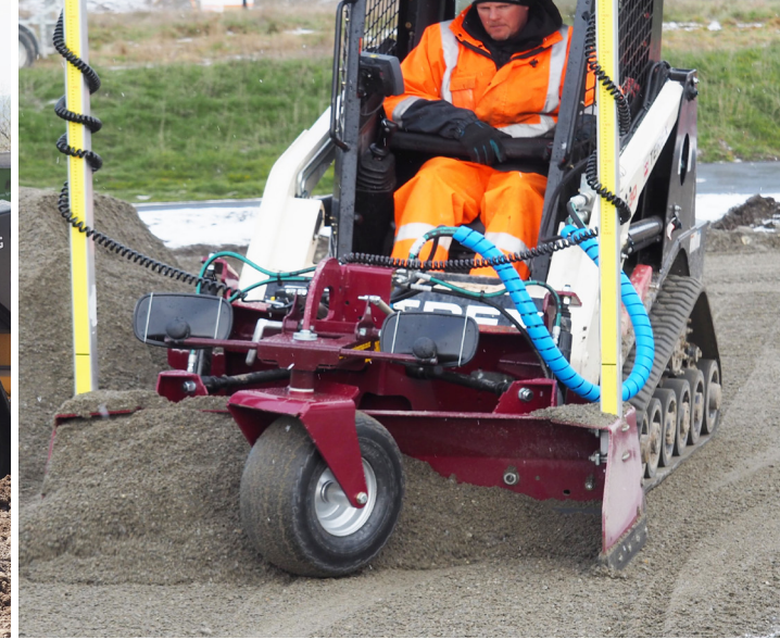
JUNIOR 1.5 (5') SERIES