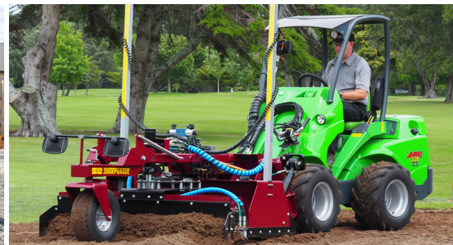
FRONT MOUNTED POWER RAKE OPTION