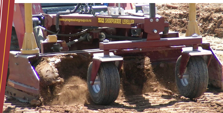
CURVED MOULD BOARD