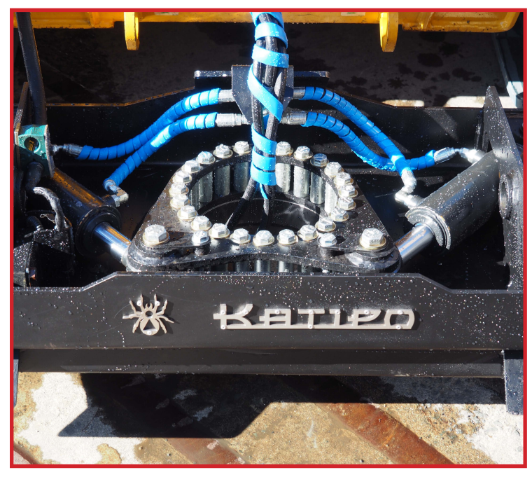
No hoses to snag