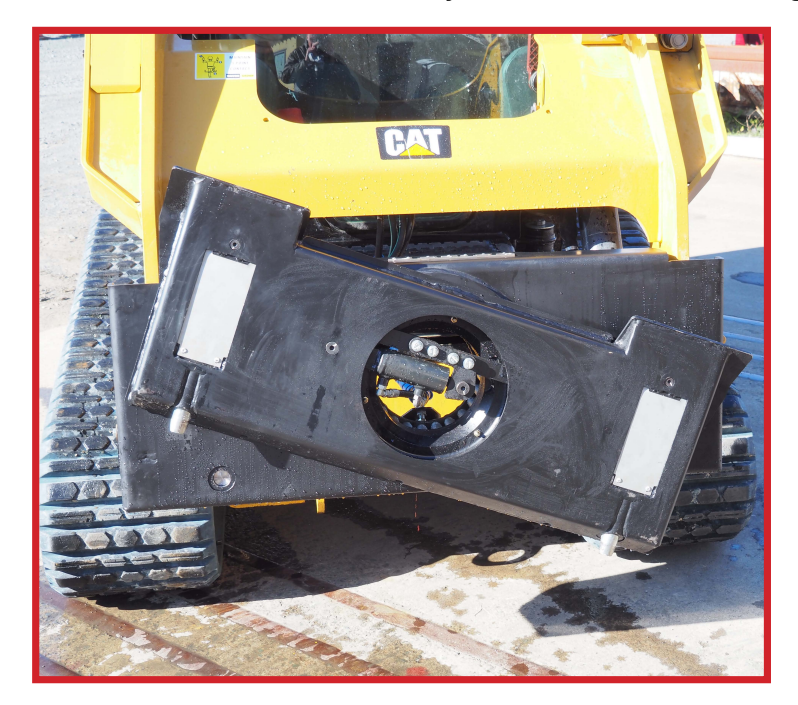
The Katipo's compact design adds only 86mm extra forward length to your machines COG

Fully controllable 22 degree left and right pitch